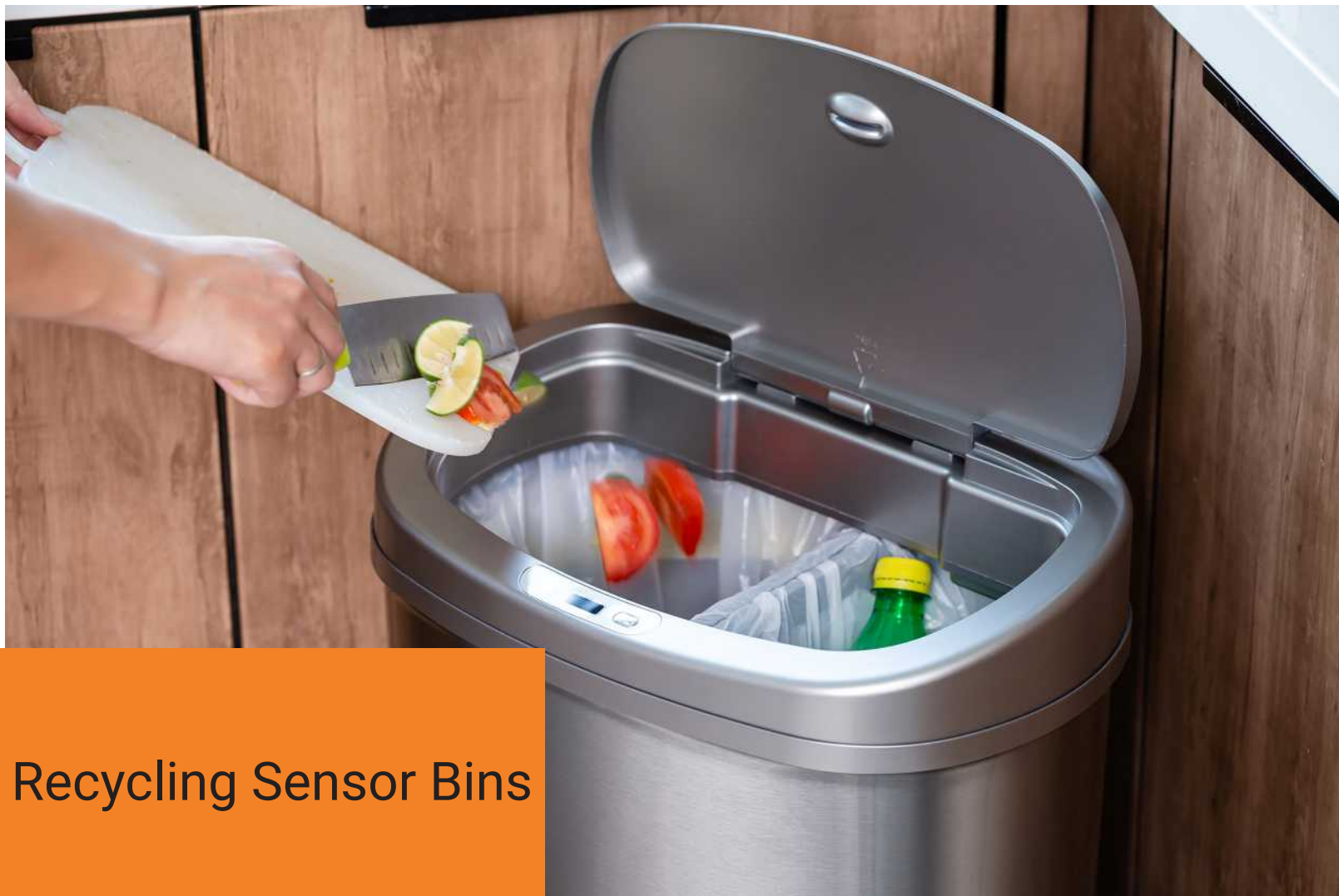
Recycling Sensor Bins